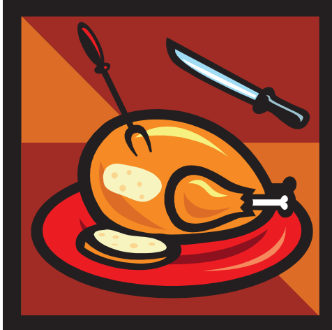
Traditional Turkey Dinner