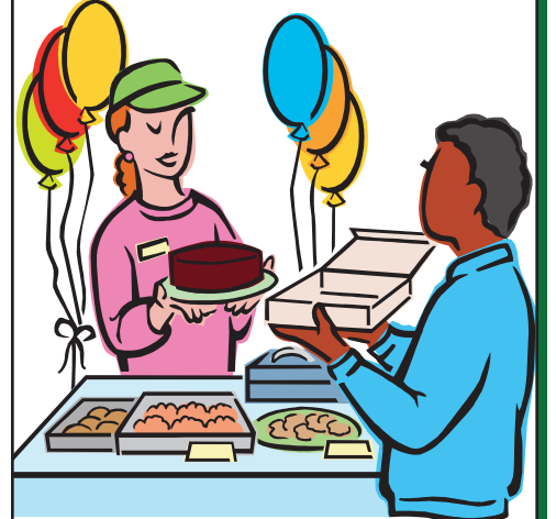
Home Baked Pies & Desserts