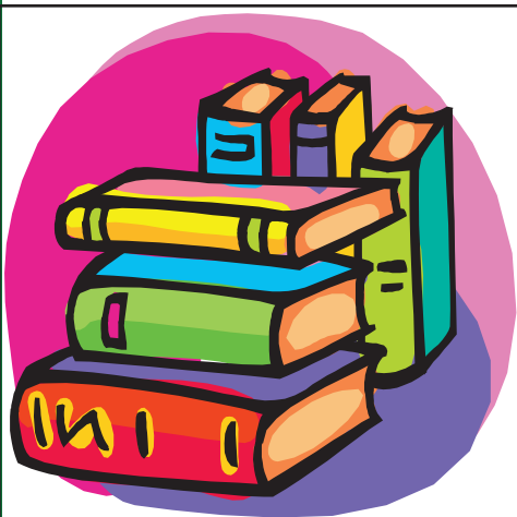
Used Books, CDs and DVDs