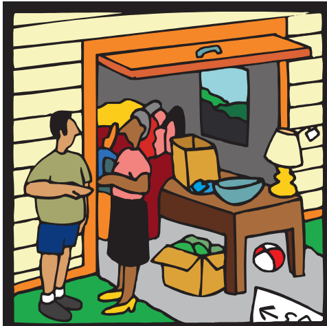
White Elephant Sale