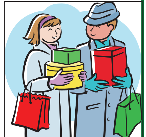
Night Before Christmas Boutique