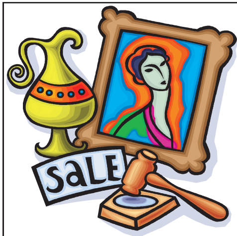
Silent Auction Treasures