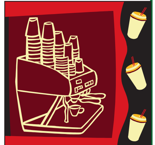
Great Espresso Booth